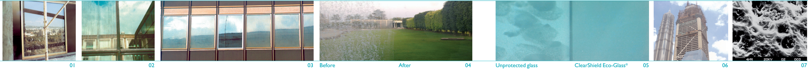
01 Contamination during construction 02 Silicone run-off 03 Hydrocarbon pollution 04 Residential glass 05 Sandblasted glass 06 Shanghai World Finance Center - ClearShield® applied to the glass in the factory prior to installation 07 The surface of glass is not smooth