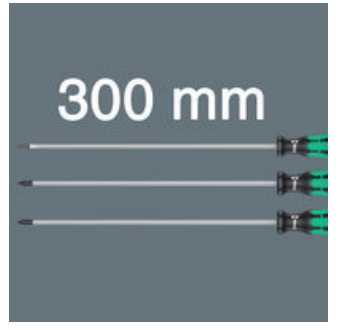
Extra-long blade for low-lying working situations.

05008730001<sup>1)</sup> 1 x PH 2 x 300 mm