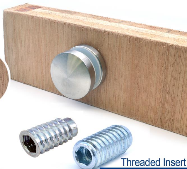
Threaded Insert for Timber